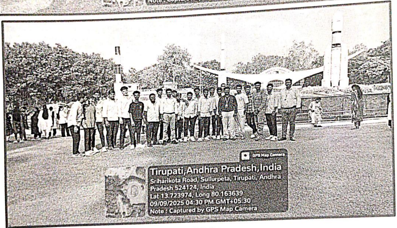
At SDSC SHAR Entrance