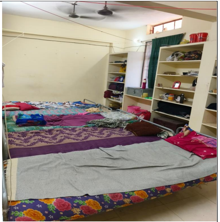
GANGA GIRLS HOSTEL BLOCK