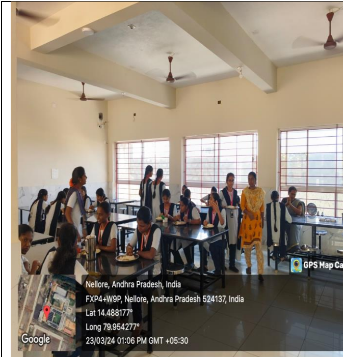
GIRLS DINNING HALL