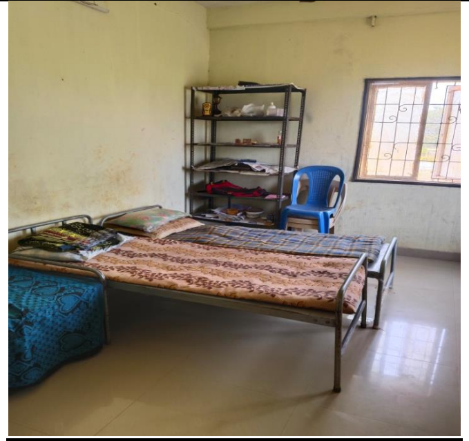
SWARNAMUKHI DIPLOMA BOYS HOSTEL BLOCK