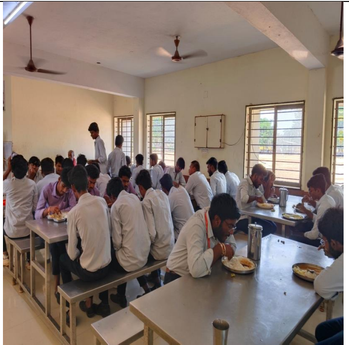
BOYS DINNING HALL