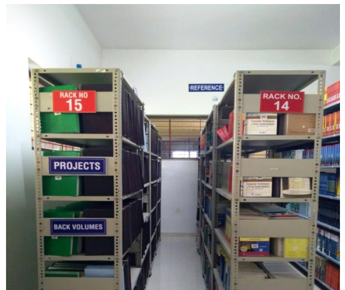
PROJECT RECORD SECTION