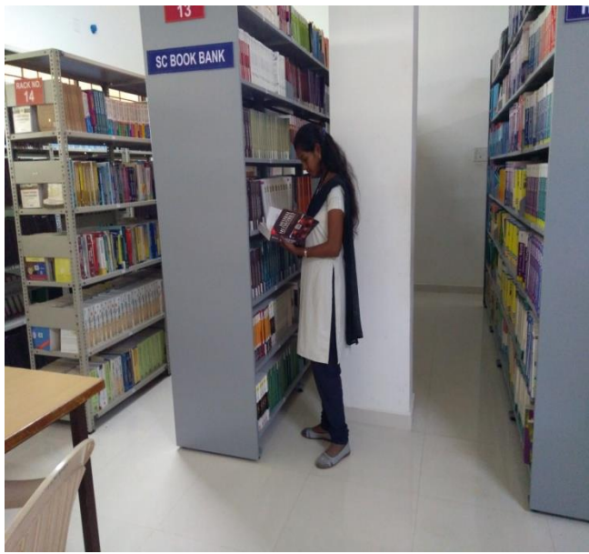
SC BOOK BANK SECTION