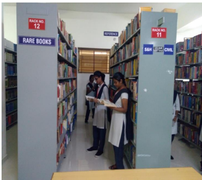
RARE BOOKS SECTION