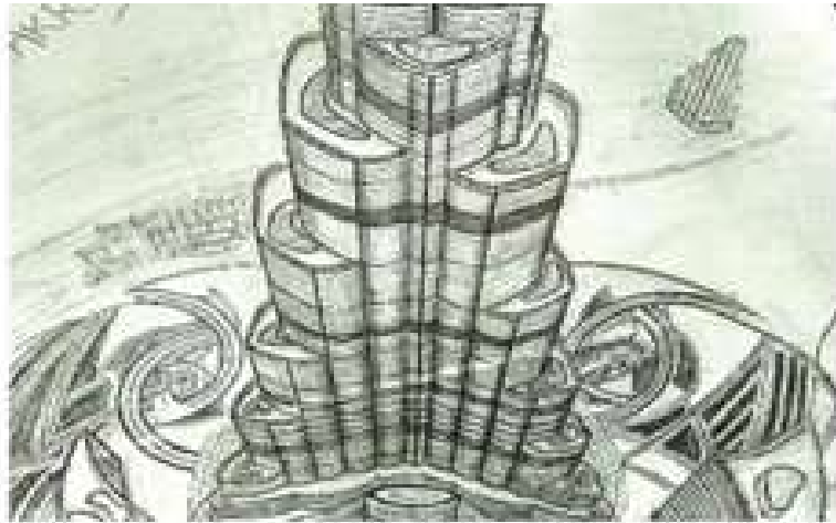
-Sk. Akram IV CE