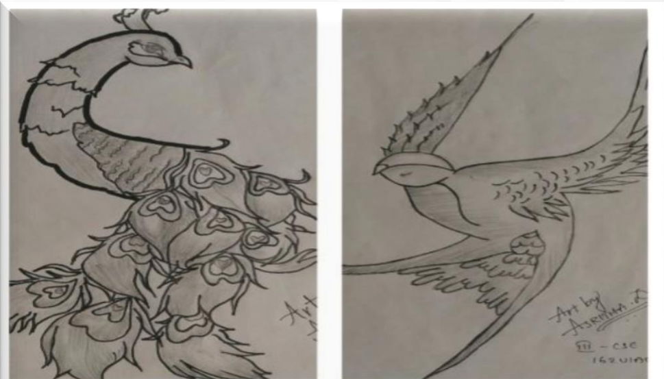
-D. Asritha III CSE