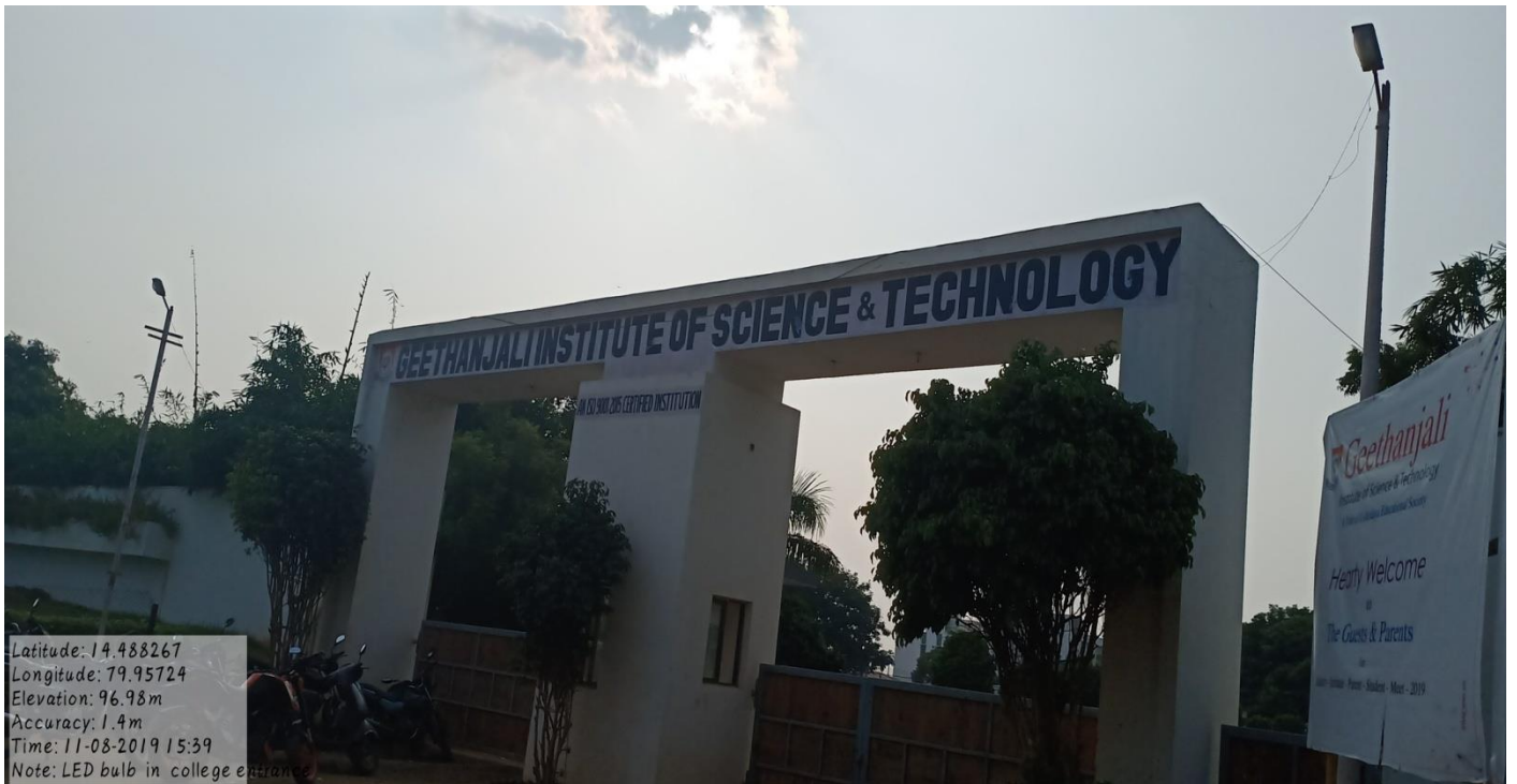
Fig: LED bulbs usage in the campus