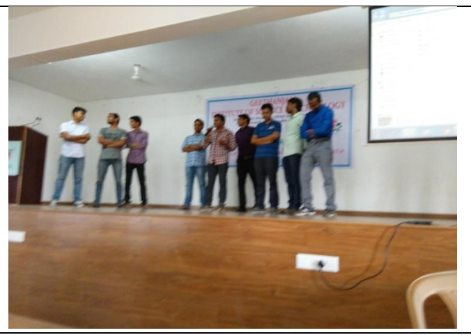
Experiences shared by former students