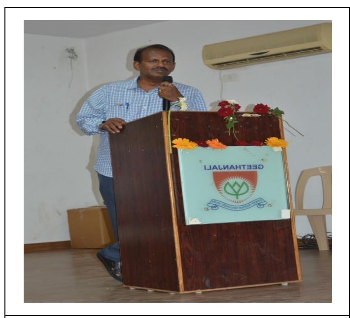
Inaugural speech by correspondent