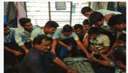
Visit to APSRTC Regional Zonal Workshop