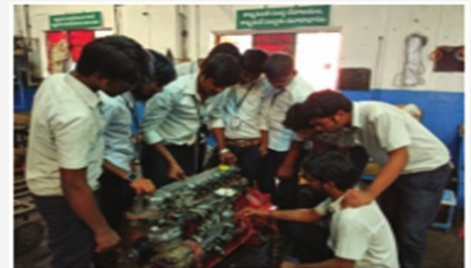
Visit to APSRTC Regional Zonal Workshop