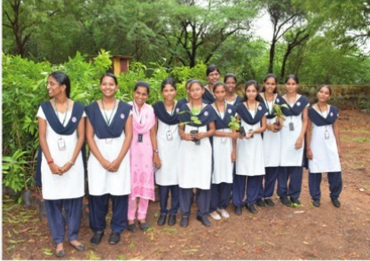
Mass Tree Plantation- Vanam Manam