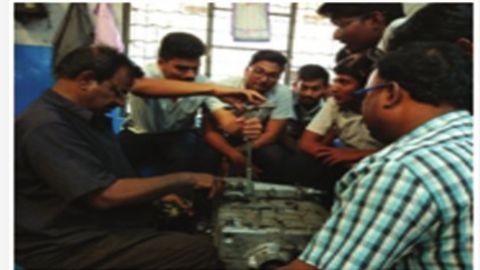
Visit to APSRTC Regional Zonal Workshop