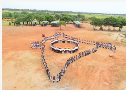
Independence Day Celebrations-Azadi 70