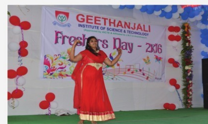
Cultural Programmes- Freshers' Day Celebrations - 2016