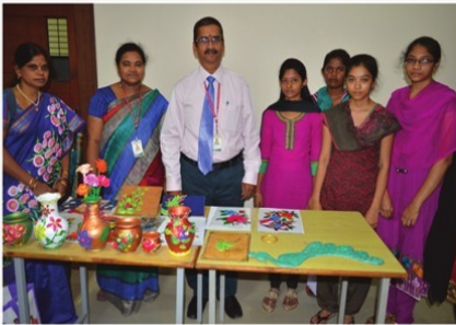
Workshop on Handicrafts