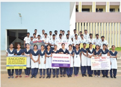
Anti-Ragging Oath- Senior Volunteers