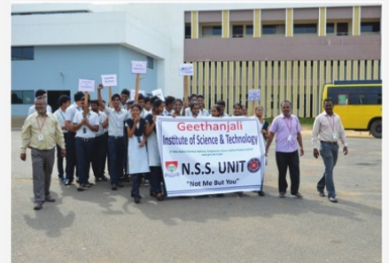
Seasonal Disease- Awareness Rally