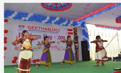
Cultural Programmes- Freshers' Day Celebrations - 2016