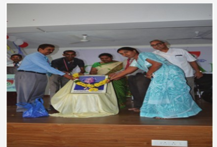
Dr. Abdul Kalam Remembered