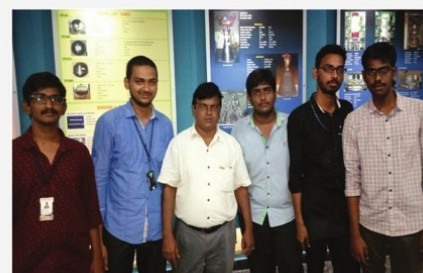
Visit to SHAR