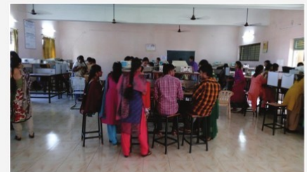
Workshop - PCB Design