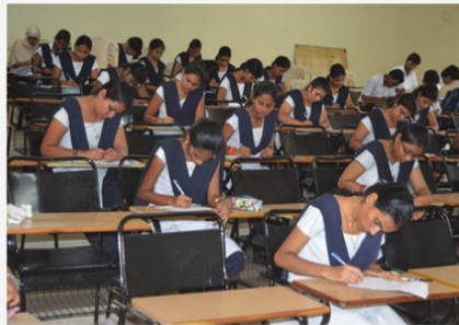
Essay Competitions- Krishna Pushkarams