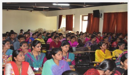
Conference - NCATCSIT-16