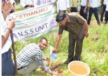
Tree Plantation- Vanam Manam