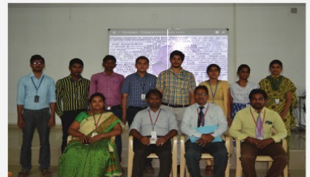
A P J Abdul Kalam Birthday