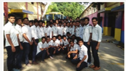
Visit to APSRTC Regional Zonal Workshop