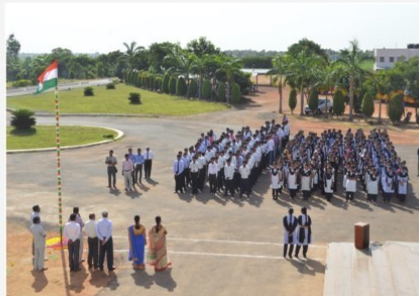
Independence Celebrations -2016