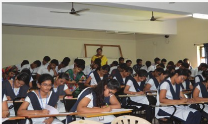
Theme Writing Contest