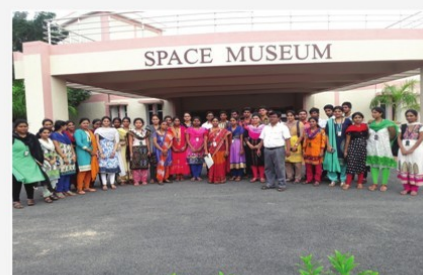
Visit to SHAR