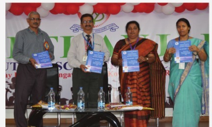
Conference - NCATCSIT-16

The Department conducted "C- Debugging - An Online Assessment test on C-programming" in association with Computer Society of India for III and IV year students to explore the programming knowledge on 22 September 2016.