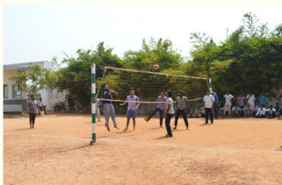
Volley Ball Winners Team