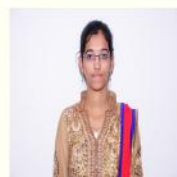
V. SAHITYA 122U1A0237 INFOVIEW