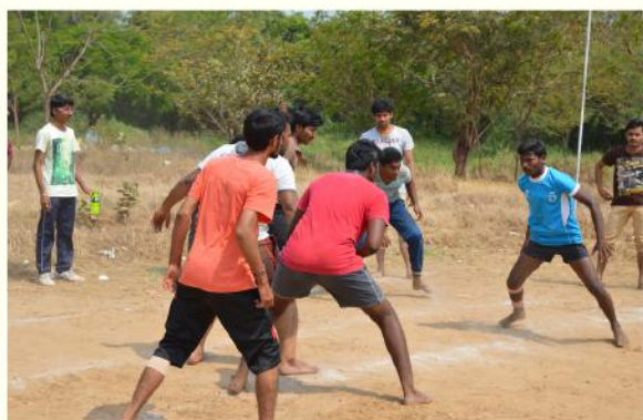
Kabaddi Winners Team

GIST volley ball team participated in JNTUA Inter University Games Meet held at Audisankara Engg College, Gudur, from 22 to 24 Mar 2016.