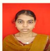
SD. AFRIN 122U1A04F5 TECH MAHINDRA