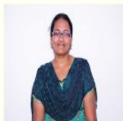
C. VINOKHA 122U1A0425 MPHASIS